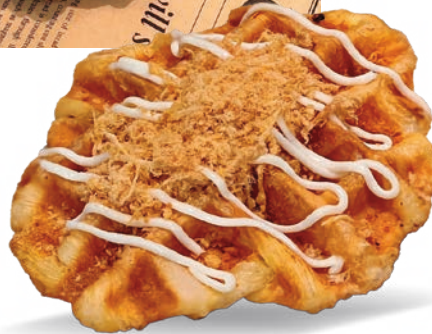
Mayo Chicken Floss