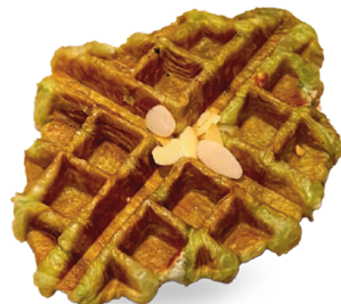
Matcha Red Bean