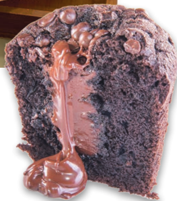
Double Choco Chip