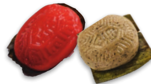
Ang Ku Kueh