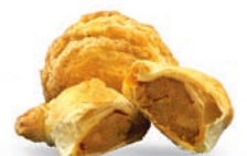
Curry Potato Puff