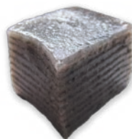
Kueh Lapis (Black Sesame)