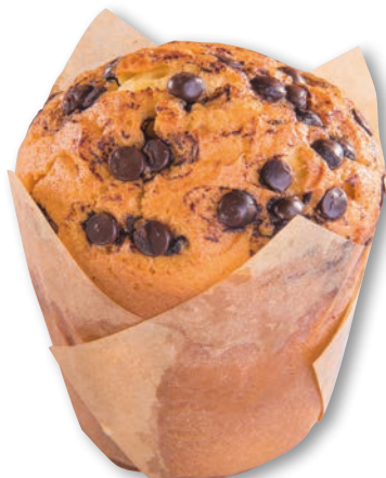
Vanilla Chocolate Chip