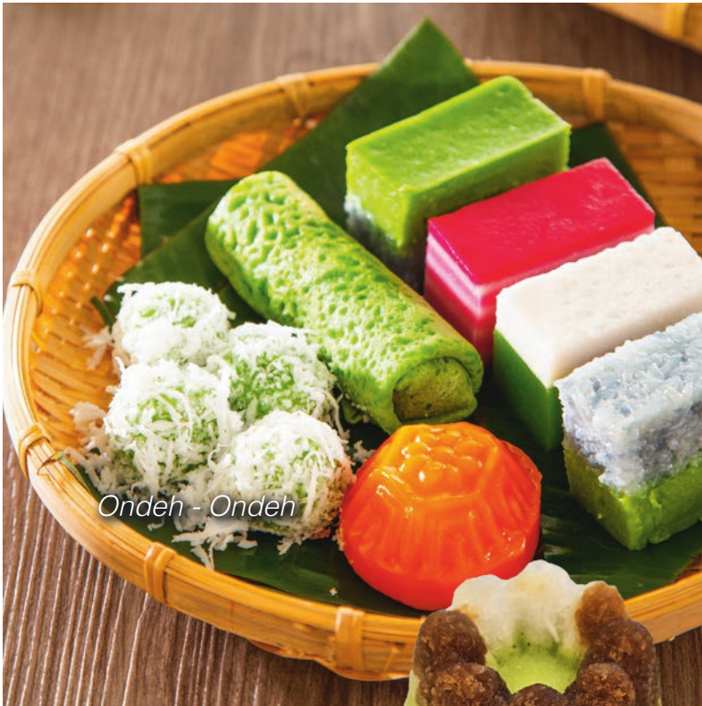
Ondeh - Ondeh