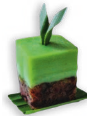
Seri Muka Pulut Hitam