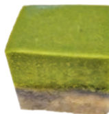
Pulut Seri Kaya (Peanut/Mung Bean/Salt-