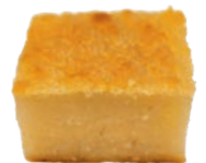
(Peanut/Mung Bean/Salted Mung Bean) Kueh Bingka